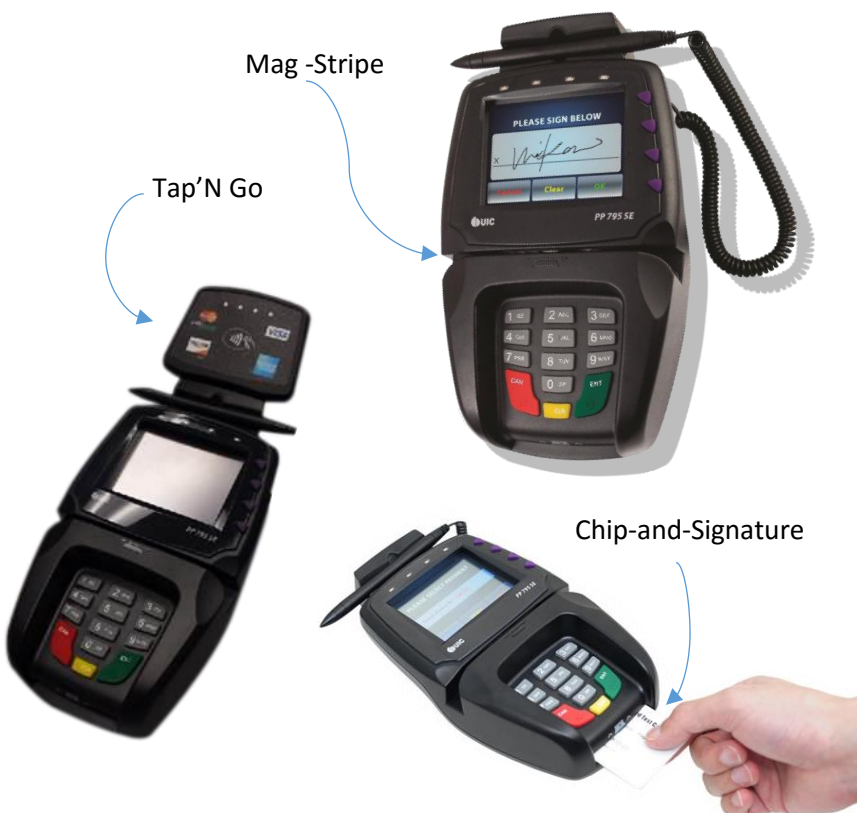
Model shown is used in the United States

The Smart Terminal Payment System uses fully automates ILS recordkeeping when used with our Smart Kiosk™ , Smart Money Manager™ Point of Sale or any of the compatible self-check systems listed below.