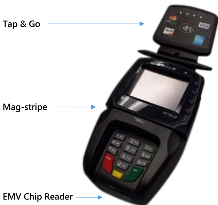
Smart Terminal model shown is used in the United States

The Smart Terminal Payment System supports fully automates ILS recordkeeping when used with leading self-check products, our Smart Kiosk™ , or our Smart Money Manager™ Point of Sale systems.