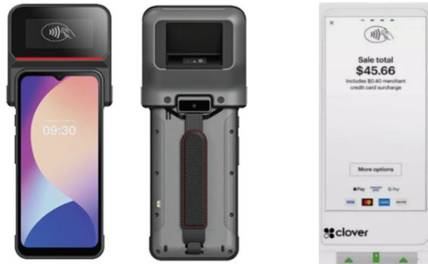
Handheld Mobile Devices with/without Printer