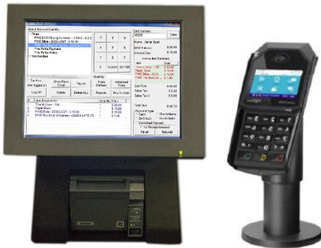
Counter PCs with Card Terminals